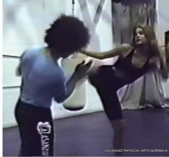
CALAGANZ PHYSICAL ARTS NORWALK